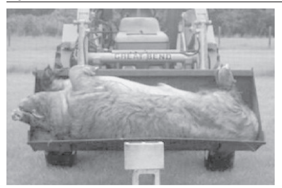
While the weight wasn't listed on this big porker, it sure filled up this frontend loader.